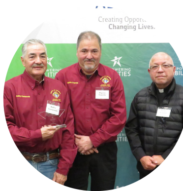
Members of the Knights of Columbus Hispanic Council 14131 accept their induction into the Empowering Abilities Hall of Fame, honoring years of generosity, volunteerism, and steadfast commitment to creating opportunities for individuals with disabilities.

Their dedication shines most visibly through their annual Tootsie Roll sales—a cherished tradition that continues to make a meaningful impact year after year. Through countless volunteer hours and tireless