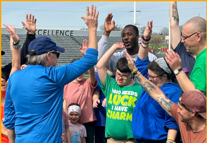
Participants from Empowering Abilities and event runners did a break-out to kick off the Cities Spring Classic events.

The Scott County Regional Authority has generously granted funds to Empowering Abilities for the acquisition of new technology equipment. This support enables participants to benefit from the latest technological advancements.