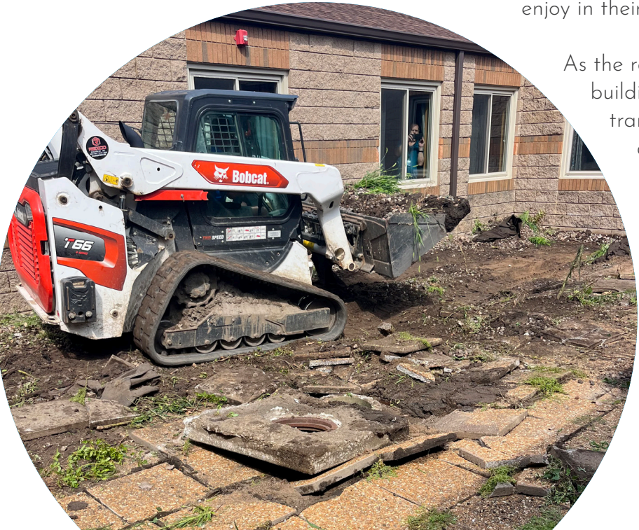
Thanks to the support of many generous donations, construction at the Residential Center for the new courtyard has started.

As the renovation progresses, excitement is building among residents and staff alike. The transformed courtyard is set to become a favorite gathering space at the Residential Center, offering a vibrant, inclusive, and engaging space for all to enjoy.